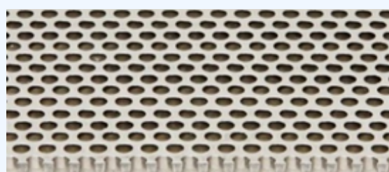
3070 OA 40.3% .1181"t x φ.0787" x .1181" centers