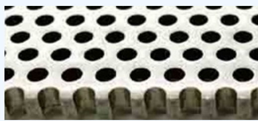
3165 OA 32.6% .2362"t x φ .1181" x .1969" centers