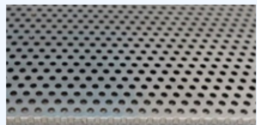
3038 OA 22.7% .0787" x φ.0394" x .0787" centers