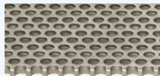
3090 OA 50.6% .1181"t x φ.1181 x .1575" centers